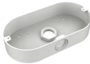
XLGNXJB201 - Junction Box 202 mm × 105 mm × 40 mm

*Design and specifications are subjects to change without notice.